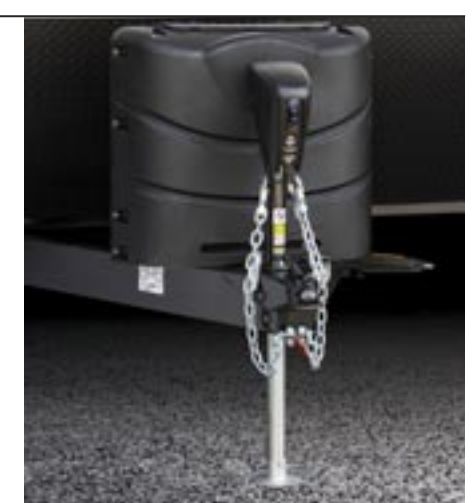
(2) 20 lb. LP bottles with cover (Optional lighted power jack with chain hooks shown)