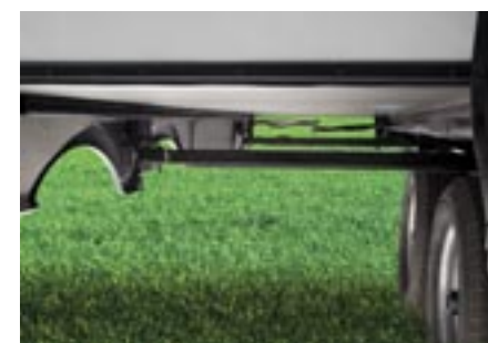
Reliable rack and pinion flush-floor slide system