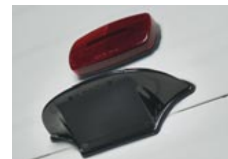
Back-up camera ready for safety and convenience