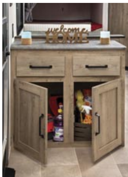
This easy access storage area provides a handy place for the gear you use most.