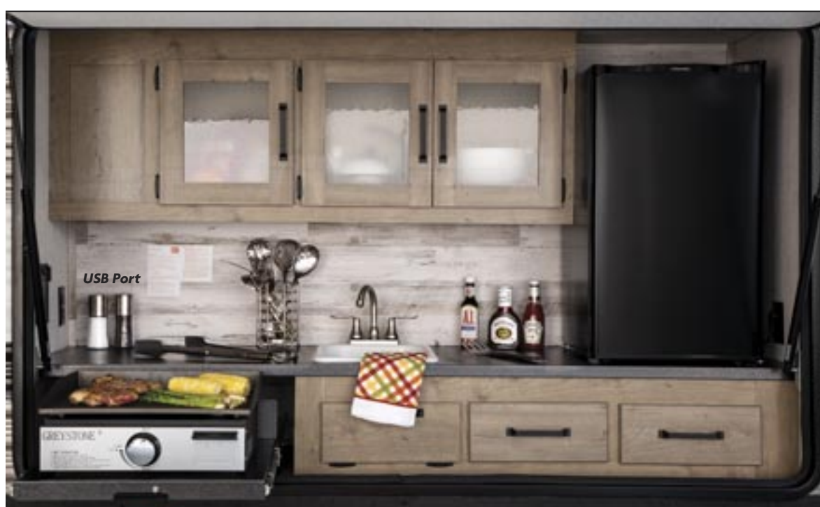
Optional outdoor kitchen has plenty of storage, both overhead and under the counter, a 3.2 cu. ft. refrigerator, a griddle, hot and cold running water, plus a handy USB wireless charging dock with expansion capabilities. (Select models)