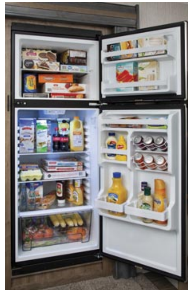
11 Cu. ft. 12V double door refrigerator/freezer