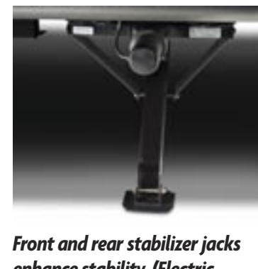
Front and rear stabilizer jacks enhance stability. (Electric option shown)