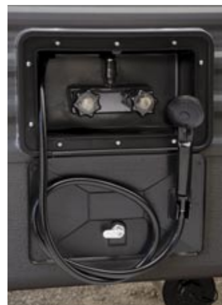
Hot and cold outside shower reduces tracking dirt indoors