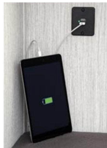
Convenient USB charging outlet ports