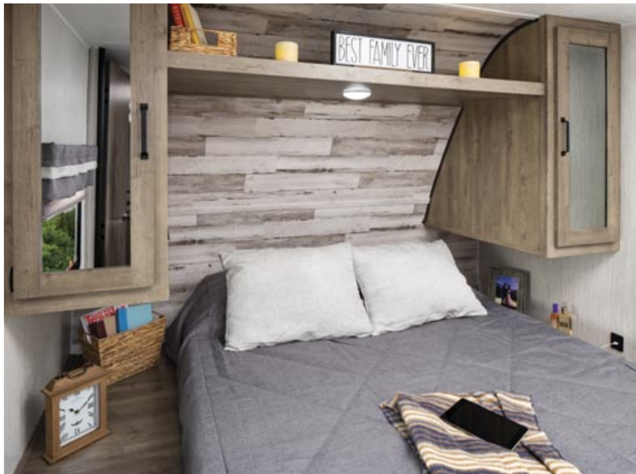
Queen bed with designer bedspread, large shirt wardrobes, and shelving