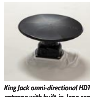
King Jack omni-directional HDTV antenna with built-in, long-range signal finder and WiFi prep