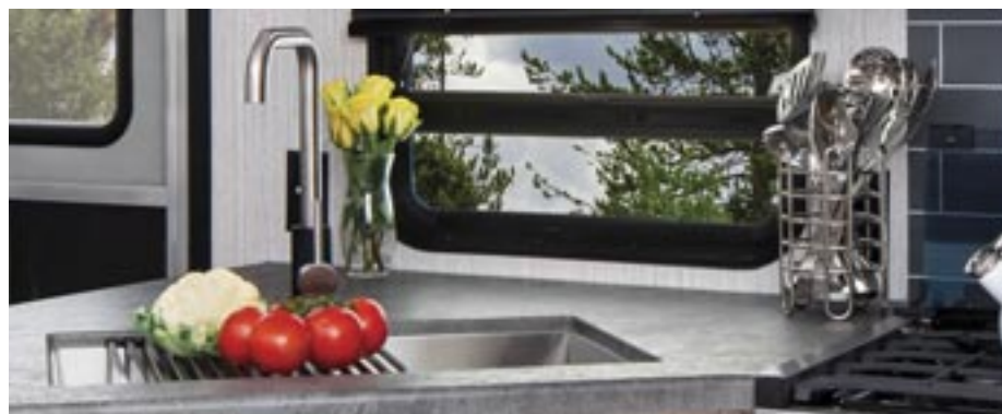
Stainless steel undermount sink with roll-up cover and single lever gooseneck faucet