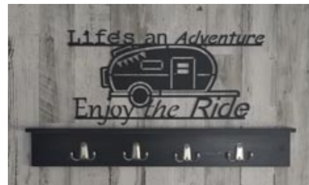
Decorative wall art with convenient coat hooks (Some models)