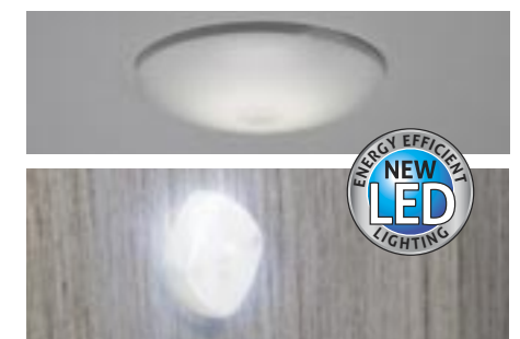
Bright, energy efficient LED interior lights with motion sensor LED bath light