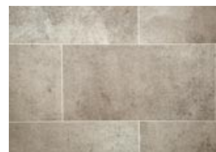
Beauflor® tile linoleum with a 7-year cold crack warranty