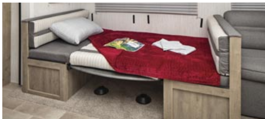
Convertible 84" U-dinette/sleeping area with storage, USB ports, 110V outlet and storage underneath