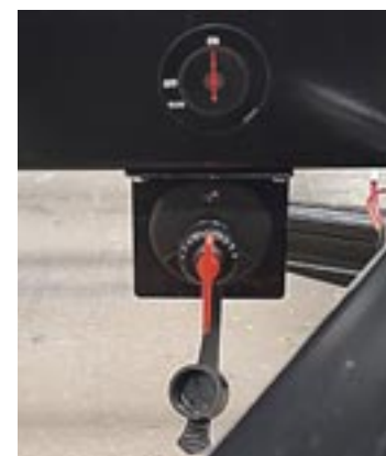
SeaFlo battery isolator switch prevents power drain. Operates by removable key