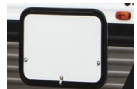
Radius compartment doors are silicone sealed to protect from the elements