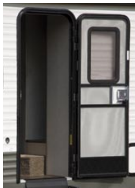
Friction hinge entry door with window and kick plate