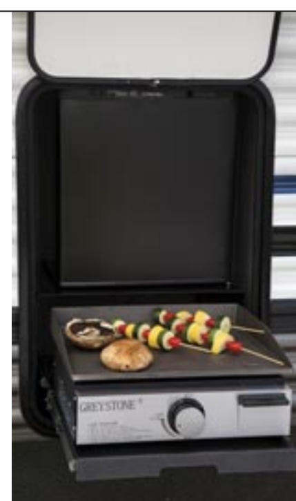
Optional Micro kitchen has a griddle, and a 1.6 cu. ft. refrigerator. (Select models)