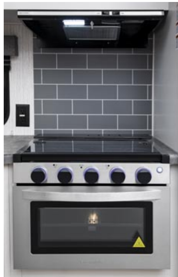
3-Burner stove and 17" oven with backlit LED controls and an easy to clean decorative backsplash