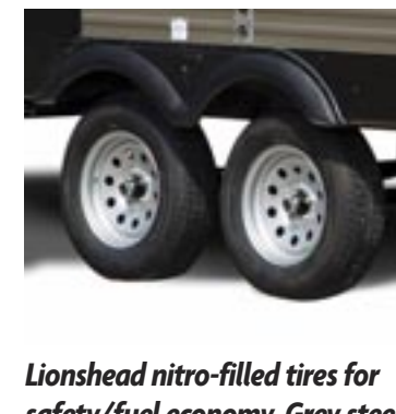
Lionshead nitro-filled tires for safety/fuel economy. Grey steel rims, Super Lube axles, ABS molded fender skirts – all standard