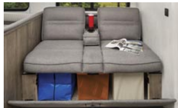
The sofa has a flip-down drink tray and plenty of storage underneath