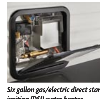
Six gallon gas/electric direct start ignition (DSI) water heater