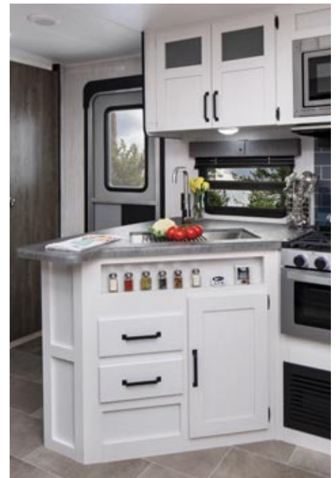
L-shaped galley features a single bowl sink, high rise faucet, sink cover and seamless countertops. Storage cabinets have both front and back access