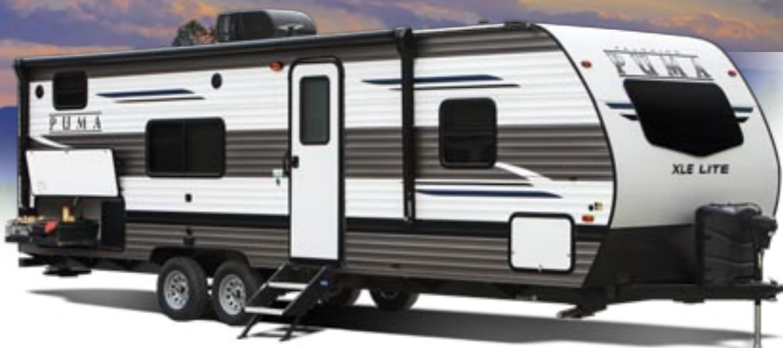
Smooth, aerodynamic two-tone exterior metal with diamond plate enhances curb appeal