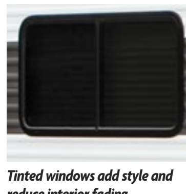
Tinted windows add style and reduce interior fading