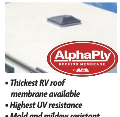
• Thickest RV roof membrane available • Highest UV resistance • Mold and mildew resistant • Won't crack or shrink over time • Limited lifetime warranty