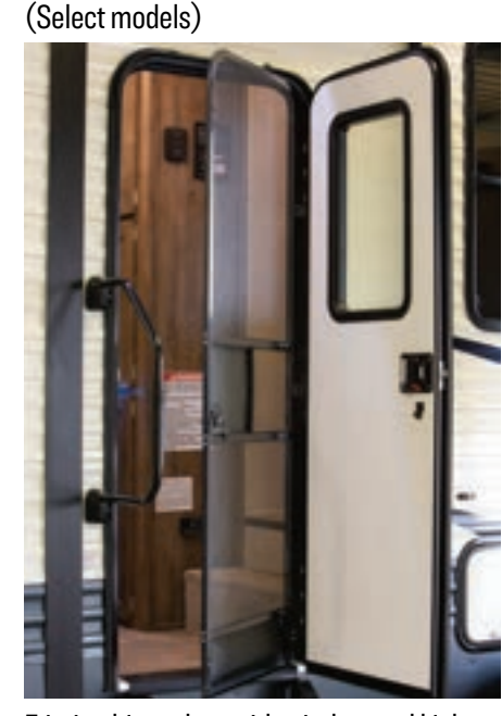
Friction hinge door with window and kick plate