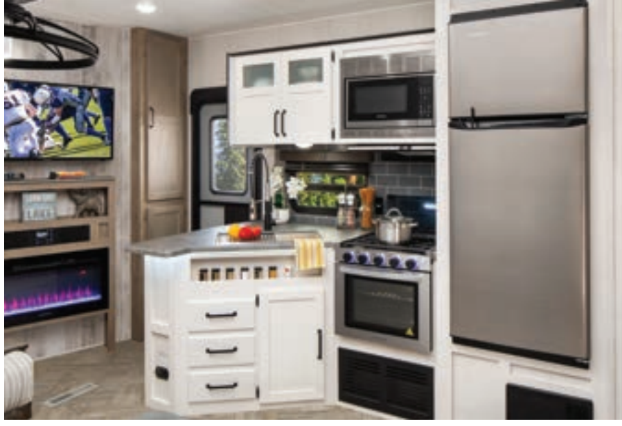
L-shaped galley has spice storage and dual cabinet access (some models). Kitchens feature a 1.3 Cu. ft. stainless steel microwave, 3-Burner stove/21" oven with backlit controls and glass cover. (Destination trailers: 4-Burner stove/24" oven)