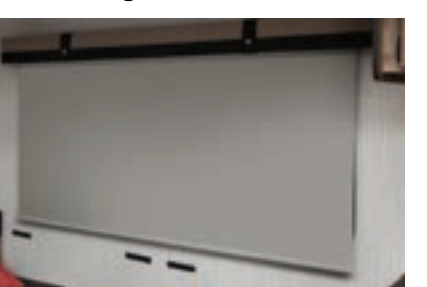
Night roller shades