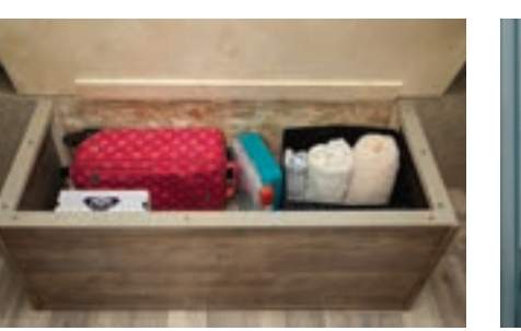
Smooth, finished edge underbed storage protects delicate items