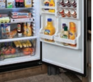
Stainless steel 11 Cu. ft., 12V refrigerator