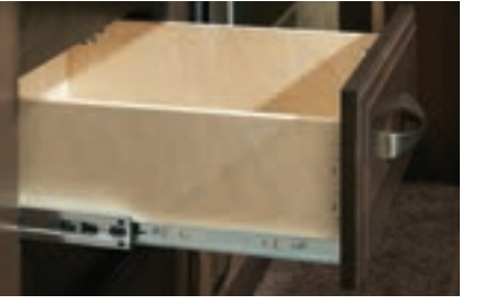
Kitchen drawer glides