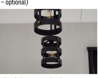
Pendant lighting over island