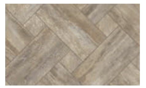
Congoleum<sup>®</sup> Designer Carefree linoleum