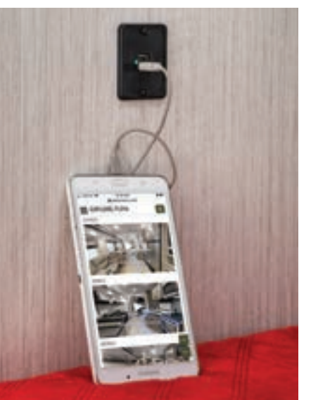
Closet with washer/dryer prep and a shelf USB charging ports