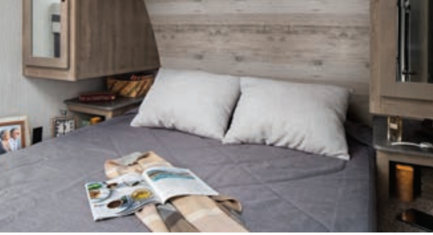
Bedrooms include a 60" x 80" queen bed, designer bedspread, pillow shams, night stands and large shirt wardrobes.