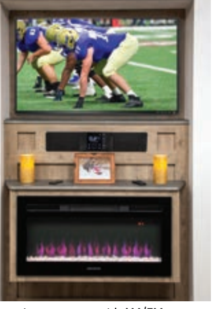
Entertainment center with AM/FM Bluetooth stereo (5,100 BTU fireplace, 39" TV – optional)