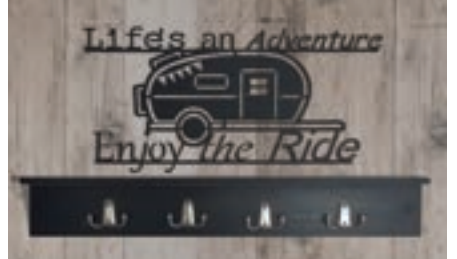
Wall art with coat hooks (Some models)