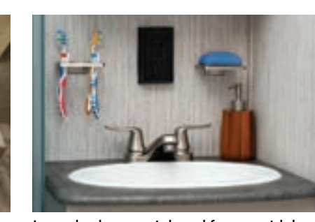
Large bathroom sink and faucet with handv soap and toothbrush holders